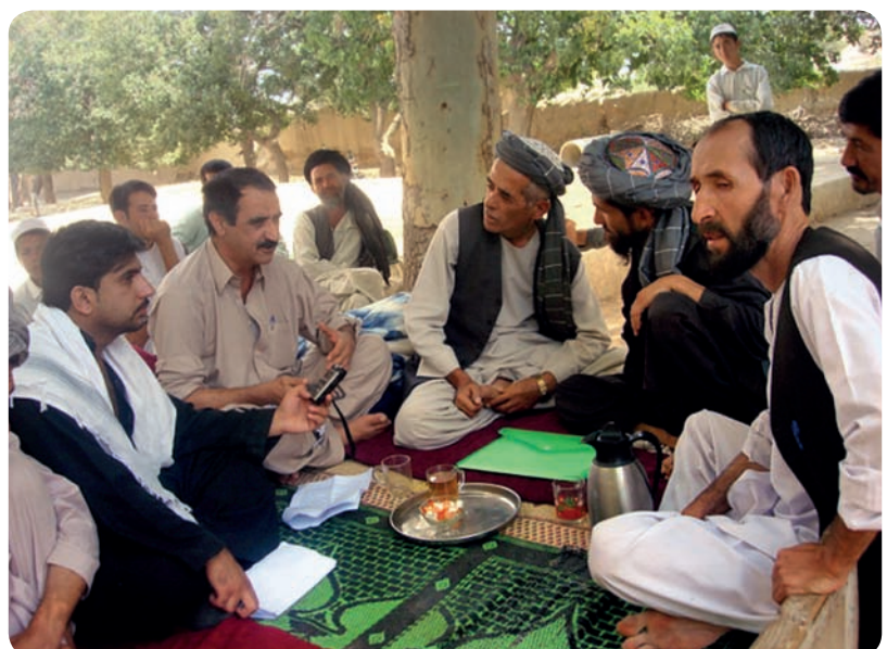
BBC AFGHAN EDUCATION PROJECTS

Below A focus group discusses the present state of the Afghan media. Research indicates that the public would like to see more effective regulation and more varied programming.