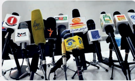
Above This bank of microphones at a Kabul press conference tells its own story of media expansion