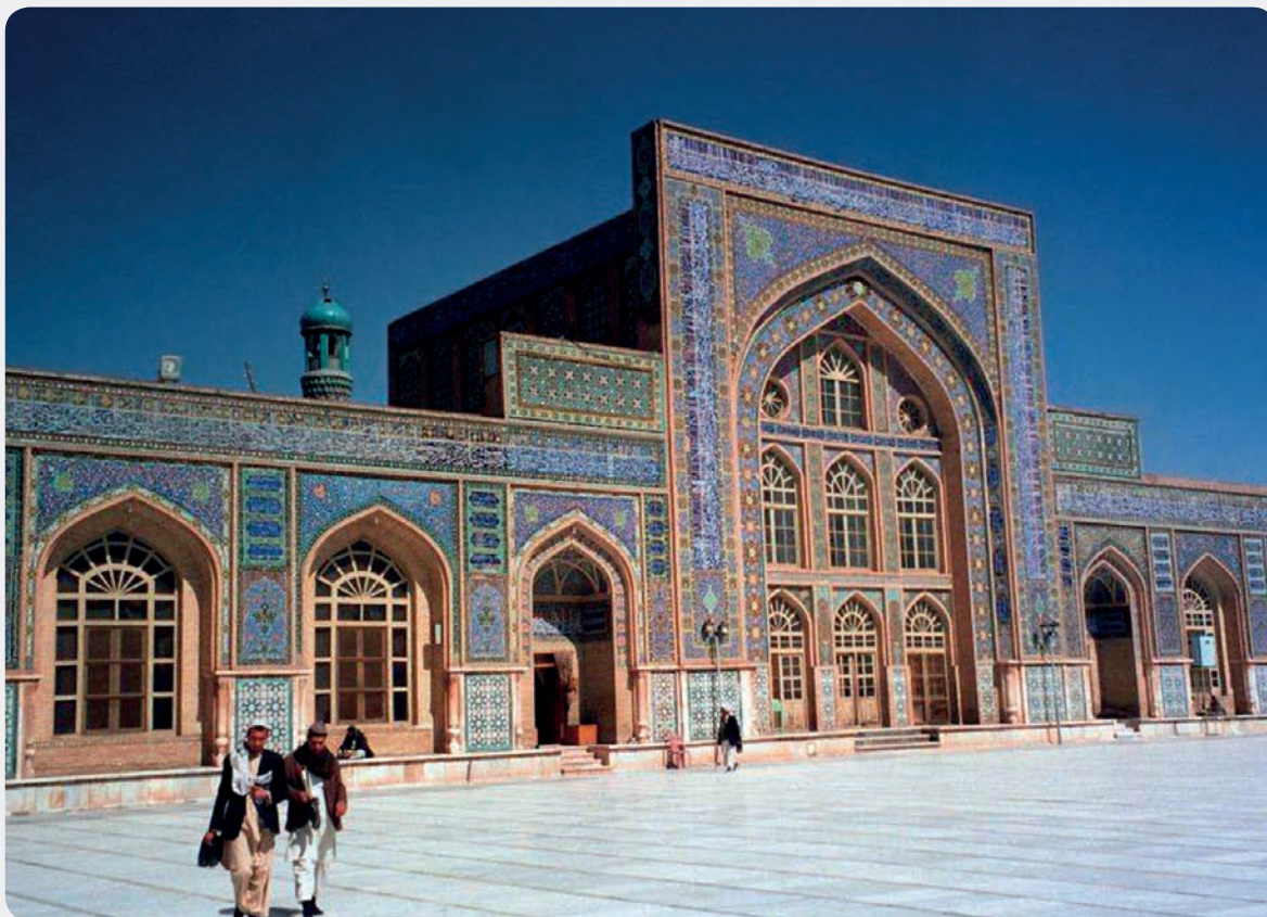
Left Herat, with its famous mosque and distinctive cultural history, was one of the first parts of the country to experience the transition to Afghan security control. Its local media are struggling to survive against national and international competition.