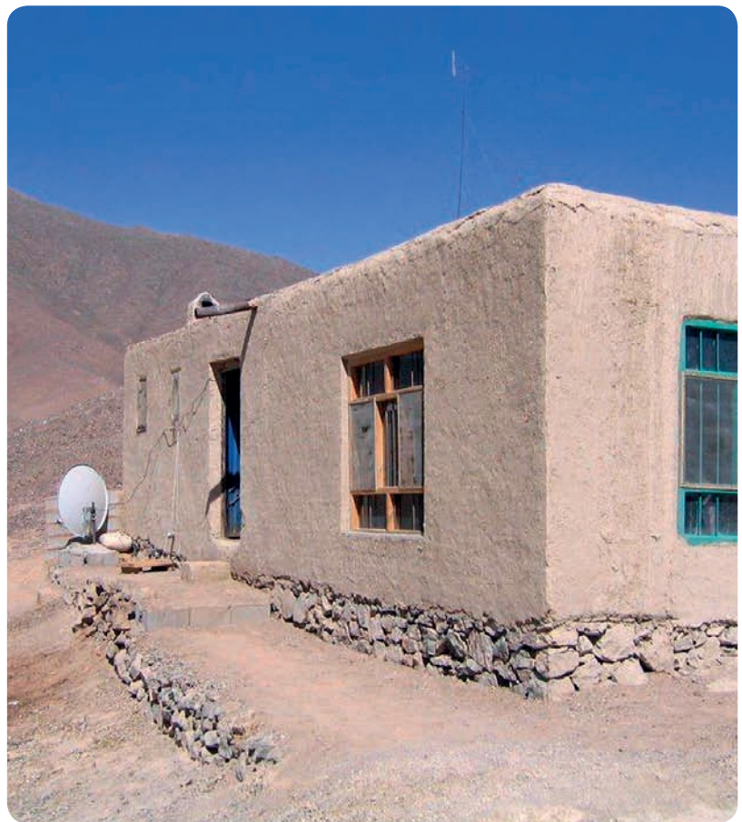
BBC/AFGHAN EDUCATION PROJECTS

The longer term vulnerability of many TV and radio stations is accentuated by the relative paucity of local advertising. Statistics on the size of the market vary considerably. In