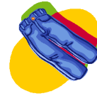
2. (a pair of) jeans