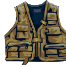
3. a waistcoat