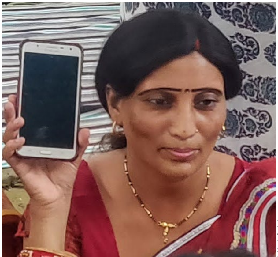
BBC Media Action

The results of this review clarify that increasing women's digital literacy depends not just on digital skills training, but on increasing their digital access and use. This is not a simple, linear process, and not just a case of distributing devices and data plans to women. There are several conditions that need to be in place, and they need to be in place in tandem. Creating women-led environments and peer networks, for example, are key ingredients of success. But these approaches can only go so far to drive women's digital adoption if the digital literacy training fails to use appropriate technology, or does not overcome women's time constraints. In a way, creating the perfect conditions for success is akin to a jigsaw puzzle: while some parts of the puzzle may be in place, it seems all the puzzle pieces are required to make an effective whole.