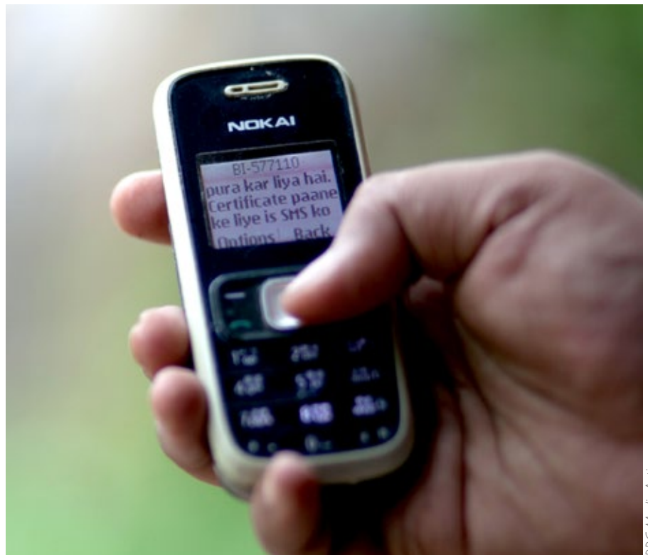
BBC Media Action

that leveraged women's empowerment collectives in India was the role of compelling use cases, which were often financial. Both the Digital Inclusion via Education (DIVE) and Smart Snehidhi initiatives in India structured learning around use cases that were both appealing to women and justifiable to gatekeepers to overcome the relevance barrier.