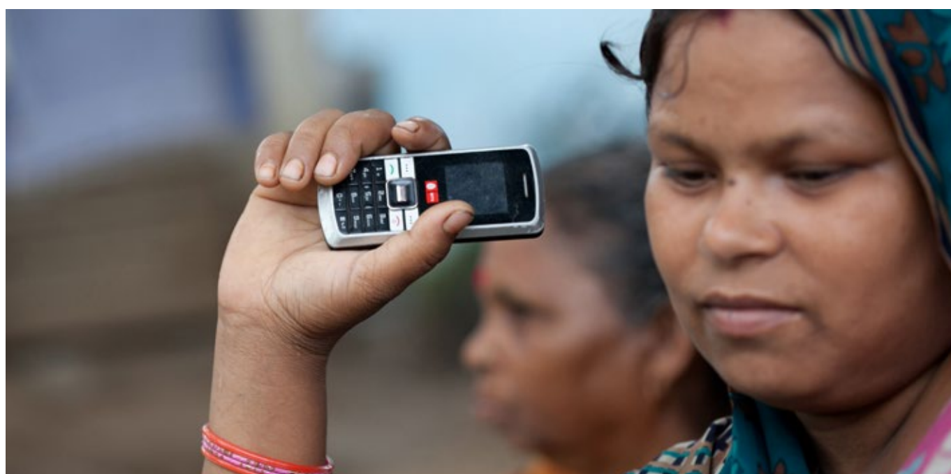
BBC Media Action

A perceived lack of relevance is a significant barrier to women's use of the internet in India. 45 The Viamo intervention aimed to change women's perceptions by providing access to audio content explaining the internet, what kinds of phones they need to access it, and safety and privacy issues. 46 The KaiOS Life app had curated content for women on a wide range of topics. In addition to digital literacy content, there