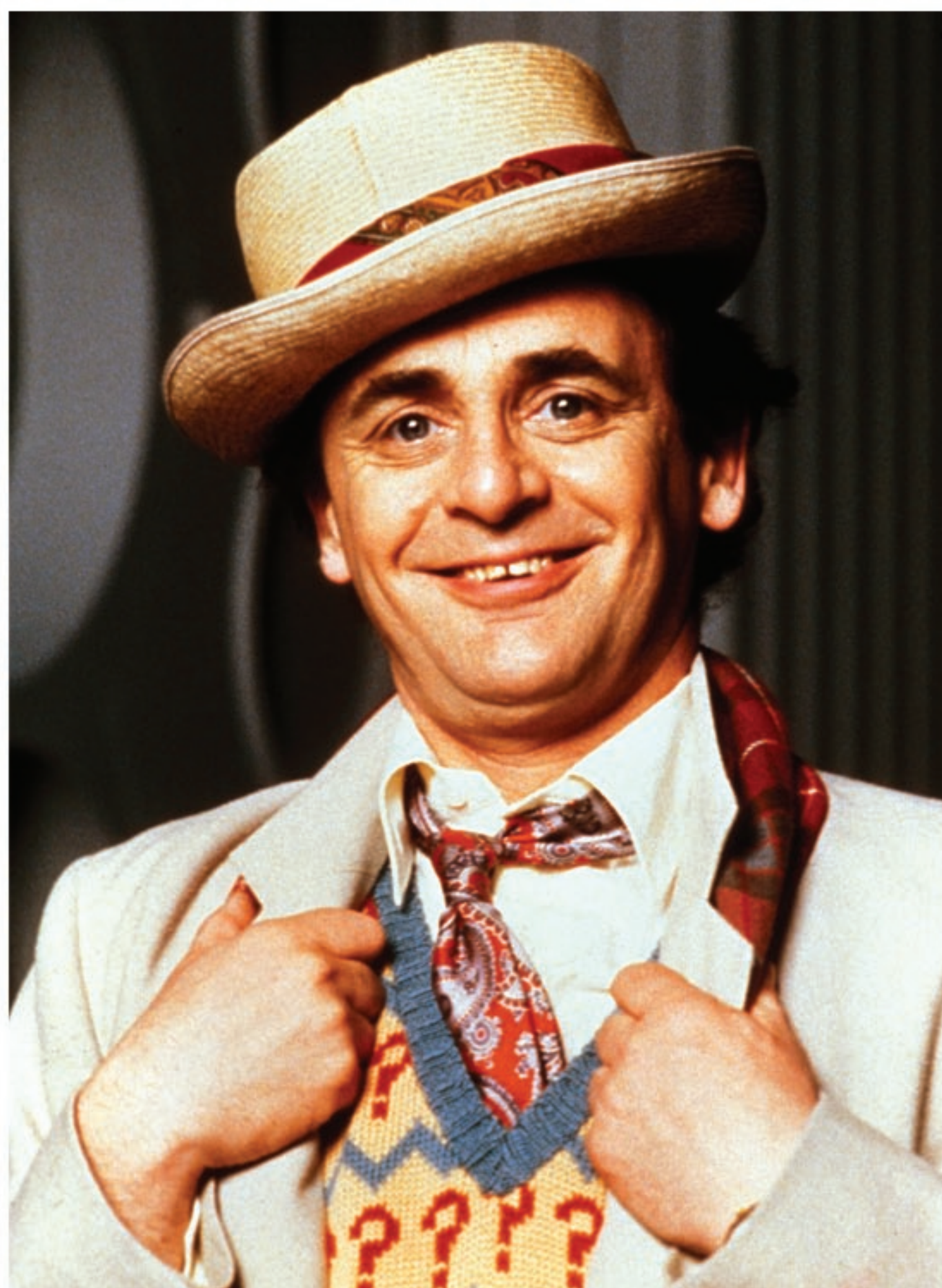
The Seventh Doctor

Not to be resold or reproduced. www.bbc.co.uk/doctorwho