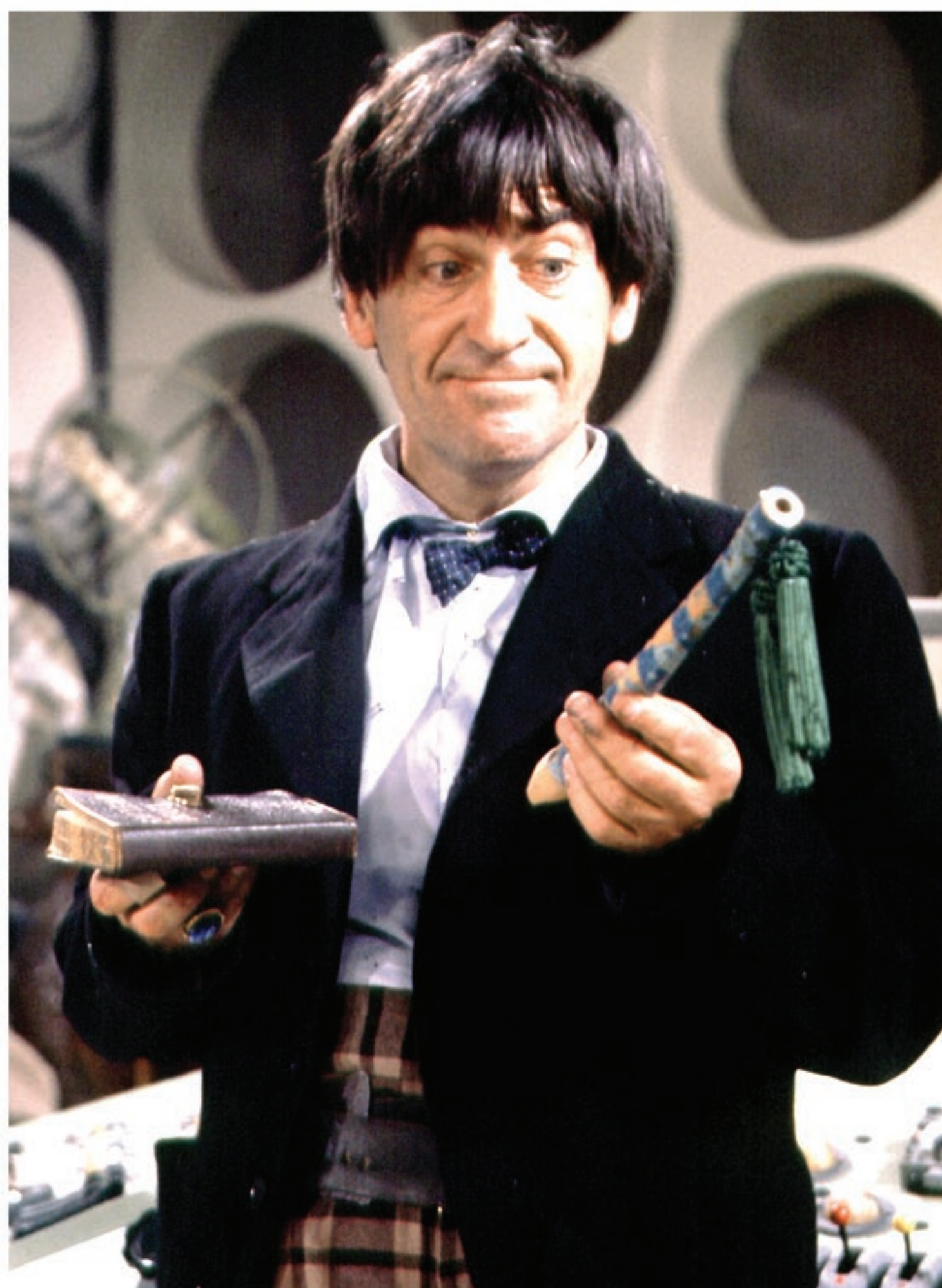
The Second Doctor

Not to be resold or reproduced. www.bbc.co.uk/doctorwho