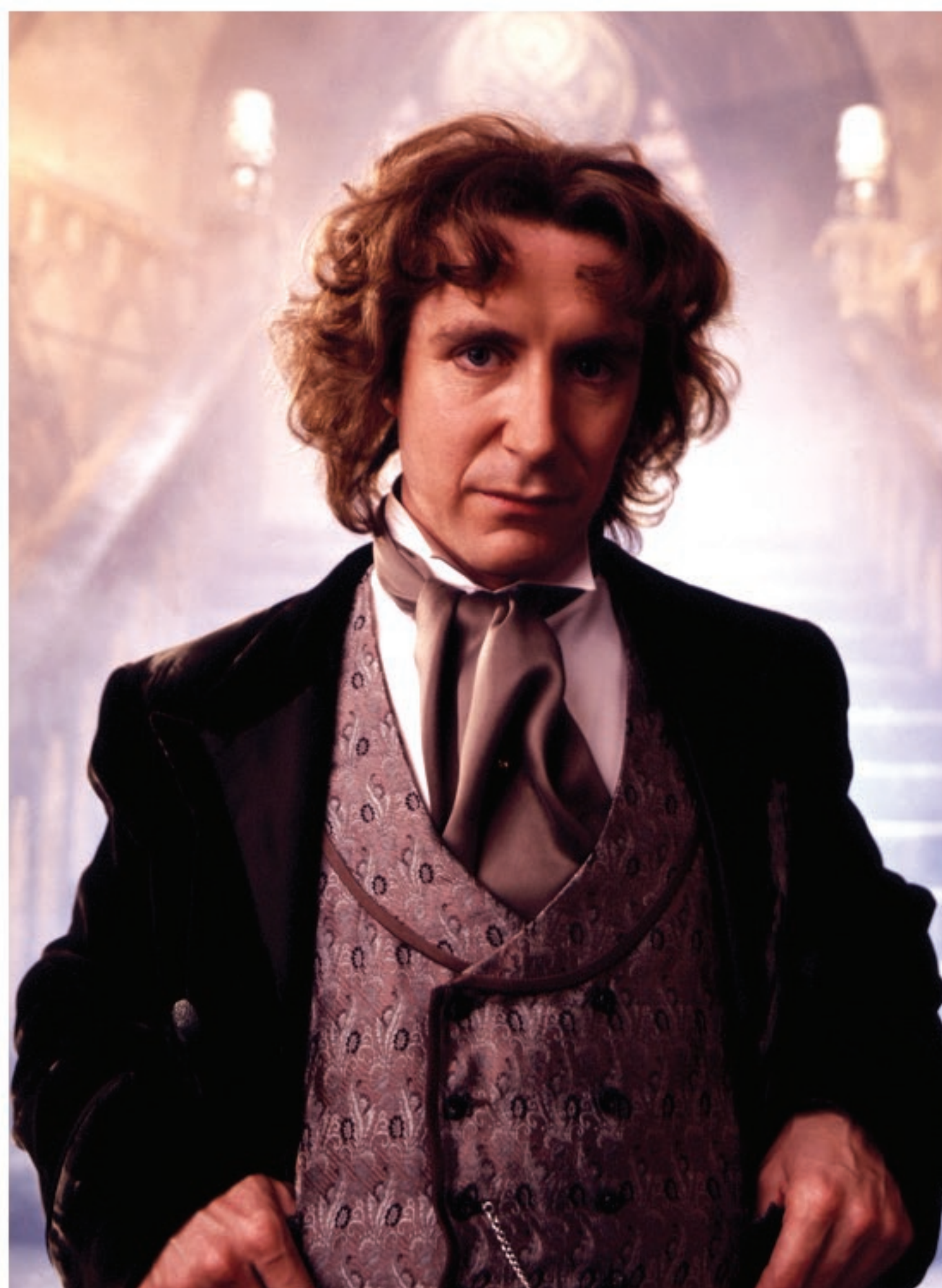
The Eighth Doctor

Not to be resold or reproduced. www.bbc.co.uk/doctorwho