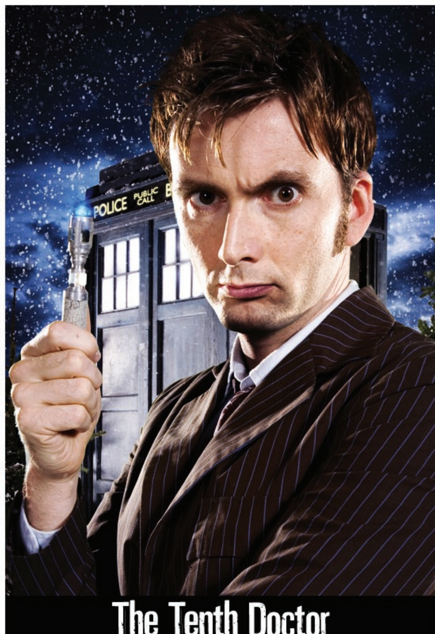
The Tenth Doctor

Not to be resold or reproduced. www.bbc.co.uk/doctorwho