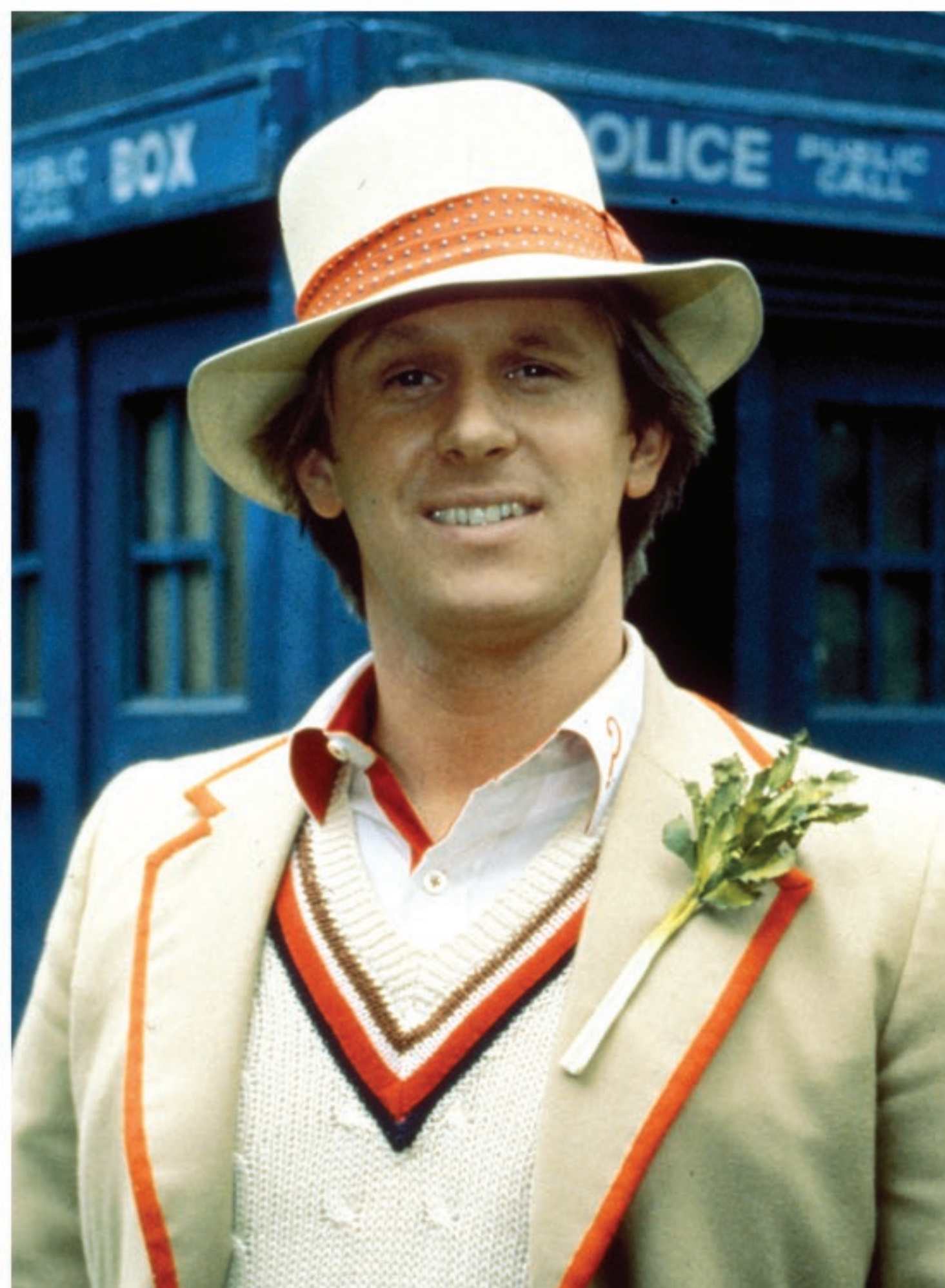
The Fifth Doctor

Not to be resold or reproduced. www.bbc.co.uk/doctorwho