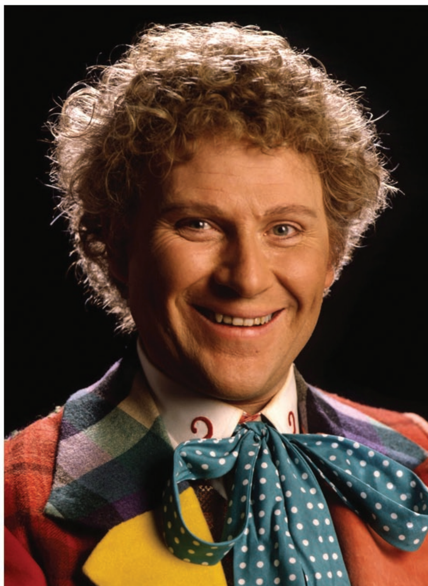
The Sixth Doctor

Not to be resold or reproduced. www.bbc.co.uk/doctorwho