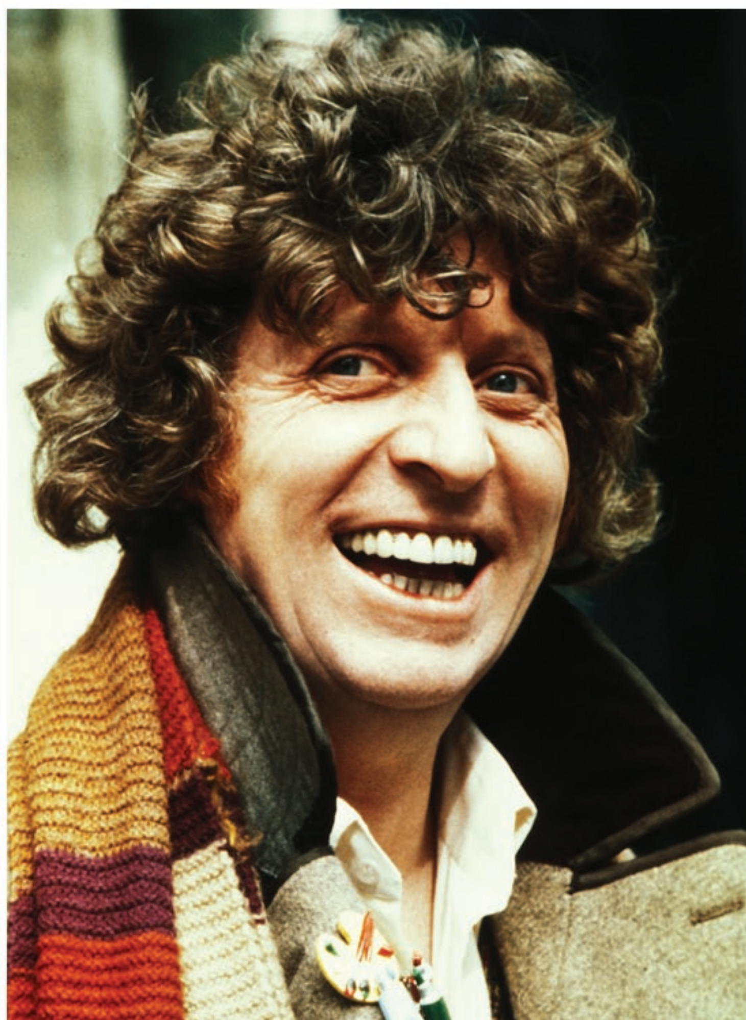
The Fourth Doctor

Not to be resold or reproduced. www.bbc.co.uk/doctorwho