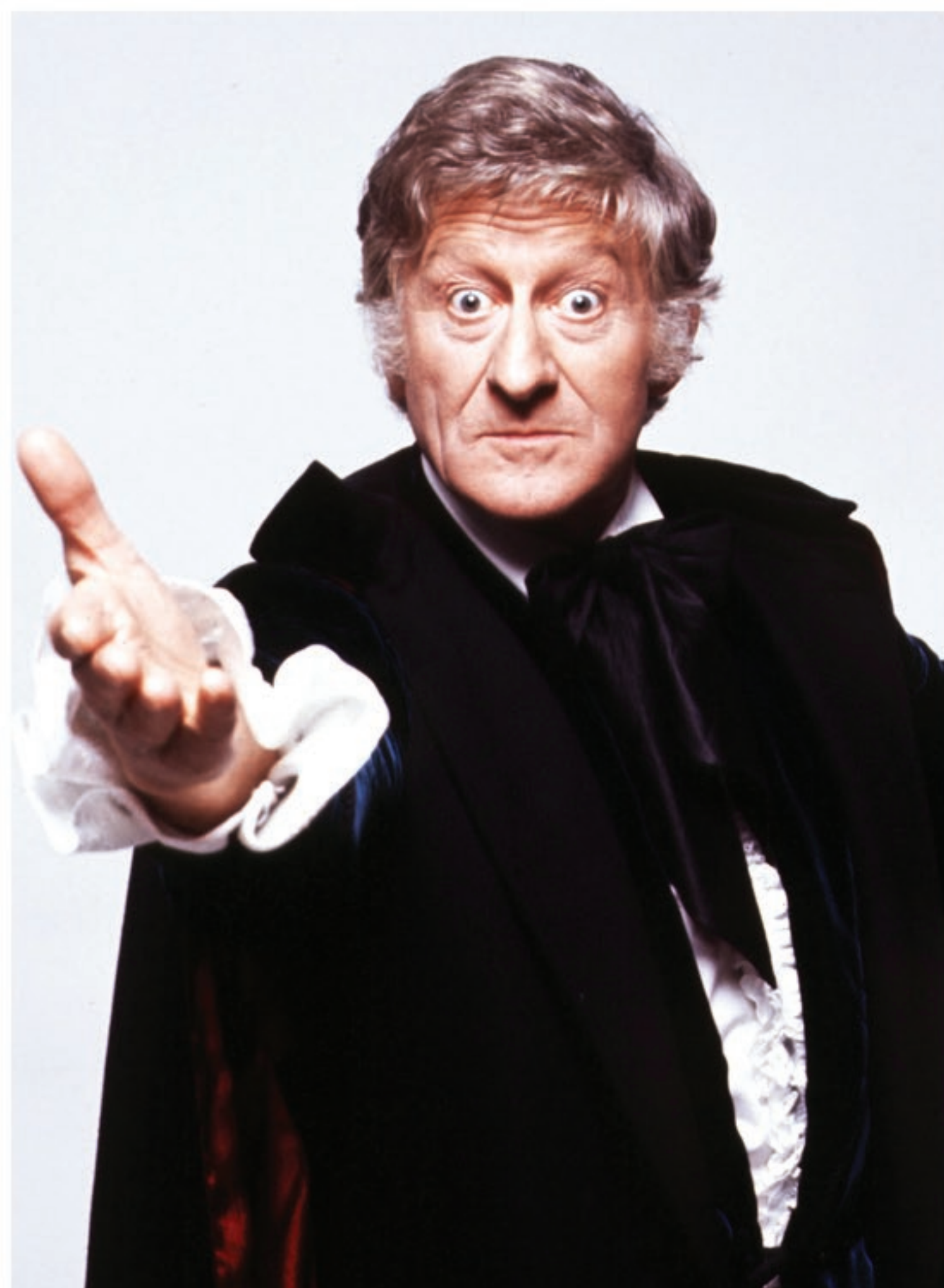
The Third Doctor

Not to be resold or reproduced. www.bbc.co.uk/doctorwho